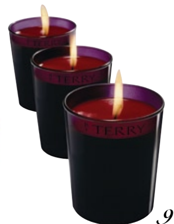
1. Burlesque and the Art of the Teese, by Dita Von Teese £25 2. Myla, Cascade Diamante Bra £449, and Diamante Belt £199 3. Agent Provocateur, AP Maitresse 100ml £65 4. Agent Provocateur, Gwendoline Corset £175 5. Agent Provocateur, Gangsta Bra £85, and Suspender Brief £65 6. Pout, Bustier Bust Enhancing Cream, Pout £25 7. Kurt Geiger, KG Angel £65 8. Mon Cheri III Makeup Bag from sweetoriginal.com 9. Space NK, Terry Lumiere d'Interleure Candles (only available at St Ann's store) £35